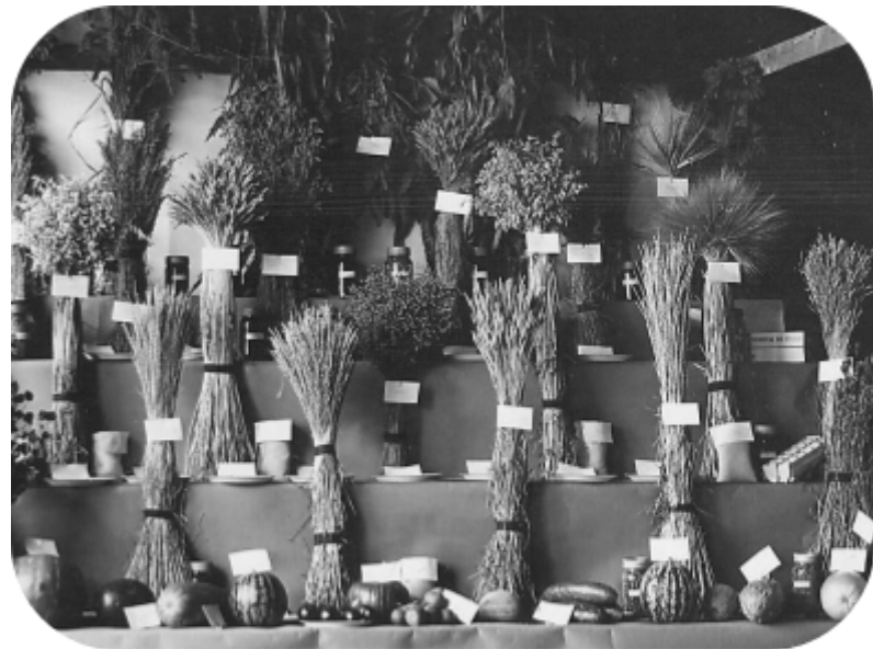
Fort Vermilion Fall Fair Sept. 6, 1938. Grazier W. Rye grass, Meadow Fescue, Timothy, Commercial Western Rye Grass, Comm. Brome Grass, Grimm Alfalfa, Oats, Wheat, Barley, Flax.