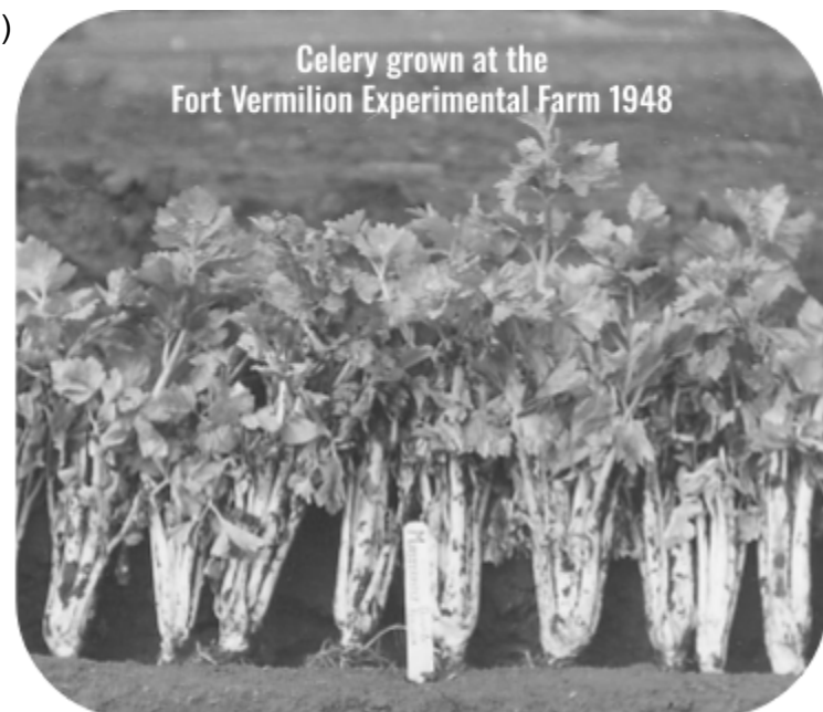
Celery grown at the Fort Vermilion Experimental Farm 1948